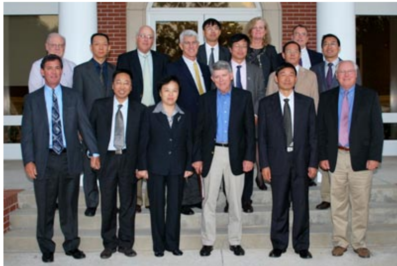
Under the U.S.-China Cotton Leadership Exchange Program established by the NCC and the China Cotton Association, eight Chinese cotton industry leaders visited the U.S. Cotton Belt to learn more about the U.S. cotton industry.

Eight Chinese cotton industry leaders visited the U.S. Cotton Belt to learn more about the U.S. cotton industry. The China Cotton Association (CCA) executive delegation's visit the U.S. was the third since the establishment of the U.S.-China Cotton Leadership Exchange Program by the NCC and the CCA. The exchange between the two countries was established by a Memorandum of Understanding signed in 2006 that promised cooperation between the countries' cotton industries.