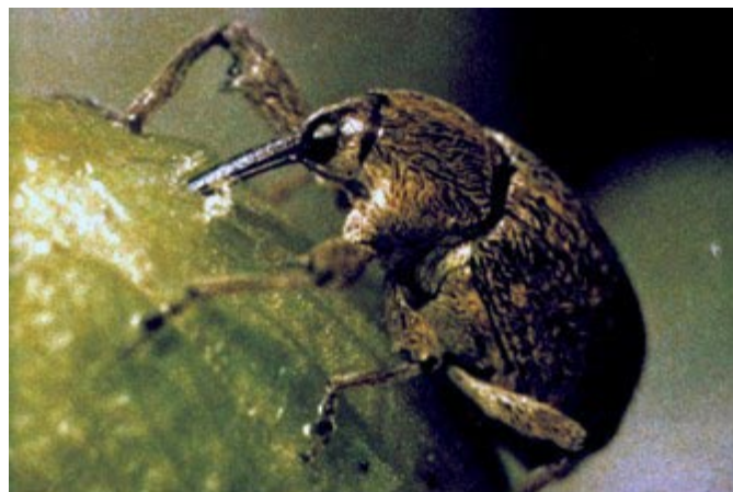
The NCC worked to secure EPA approval of a supplemental label for addressing the Boll Weevil Eradication Program's needs through 2011.

The NCC also worked closely with Malathion's registrant to secure EPA approval of a supplemental label for addressing the Boll Weevil Eradication Program's needs through 2011. The NCC's Boll Weevil Action Committee (BWAC) passed a motion that created an International Technical Advisory Committee comprised of U.S. and Mexican representatives to provide zone operation recommendations to the BWAC, which forwards approved recommendations to USDA's APHIS and urges coordinated eradication efforts on both sides of the border.