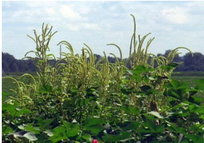
As part of its educational outreach, the NCC posted on its website, www.cotton.org , multiple new videos to help producers deal with resistance to weeds such as this Palmer amaranth (pigweed).