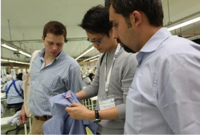
Buyers from Bultel (Germany) and Gruppo Coin (Italy) inspect a U.S. cotton garment during the COTTON USA Buyer's Tour to Thailand – one of several CCI- hosted events where brands and retailers met with international manufacturers of U.S. cotton goods.

CCI's Cotton Education program focused on increasing consumer demand for 100 percent cotton products in China and India. Many celebrities supported COTTON USA in Asia. Fashion designers from the United Kingdom to Thailand used U.S. cotton in their collections.