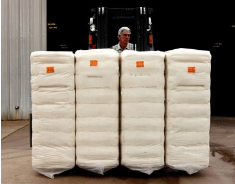
USDA approved specifications adopted by the Joint Industry Bale Packaging Committee, including official tare weights for various combinations of approved wrapping materials.

The NCC's Performance and Standards Task Force discussed concepts to operationalize the intent of NCC resolutions dealing with appropriate rewards for exceptional warehouse service and penalties for nonperformance. They formed 12 proposals, which they discussed prior to consideration by the NCC Board.