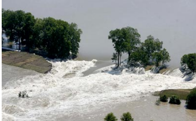
The NCC worked to gain clarification for crop insurance indemnity eligibility for flooded cropland as a result of the Mississippi River levee breaches.

more annually to other businesses. Later, President Obama signed into law H.R. 4, the "Comprehensive 1099 Taxpayer Protection and Repayment of Exchange Subsidy Overpayments Act of 2011."